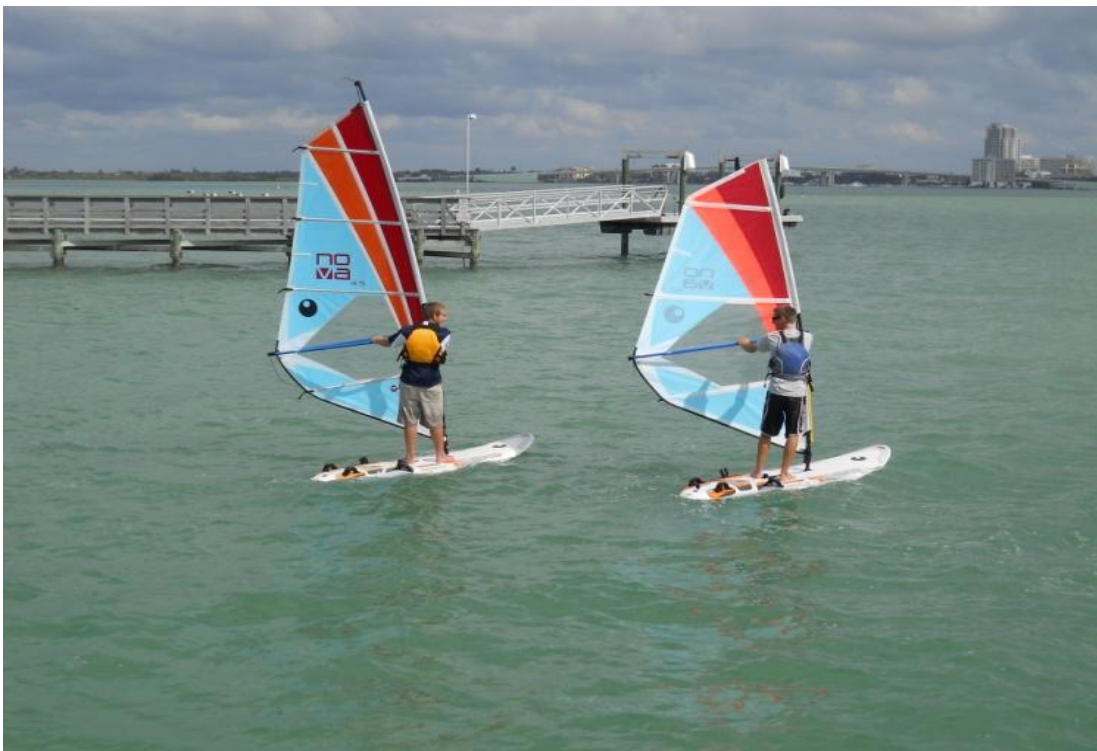
CCSC has 2 windsurfers in the fleet.

Windsurfing can be said to straddle both the laid-back culture of surf sports and the more rules-based environment of sailing. Although it might be considered a minimalistic version of a sailboat , a windsurfer offers experiences that are outside the scope of any other sailing craft design. Windsurfers can perform jumps, inverted loops, spinning maneuvers, and other "freestyle" moves that cannot be matched by any sailboat. Windsurfers were the first to ride the world's largest waves, such as Jaws on the island of Maui , and, with very few exceptions, it was not until the advent of tow-in surfing that waves of that size became accessible to surfers on more traditional surfboards. Extreme waves aside, many expert windsurfers will ride the same waves as wavesurfers do (wind permitting) and are themselves usually very accomplished without a rig on a conventional surfboard.