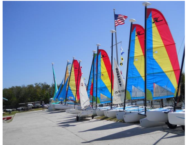
CCSC has 8 Hobie Waves and 4 Hobie Getaways and a Hobie 16

A Hobie Cat is a small sailing catamaran manufactured by the Hobie Cat Company. Begun as a manufacturer of surf boards in the late 1950s, Hobie (named after Hobie Alter , the company's founder) began manufacturing catamaran sailboats in the late 1960s and has become the largest manufacturer of small catamarans in the world. Today, Hobie's line of products ranges from surf boards to catamaran sailboats to kayaks, though the Hobie Cat Company is most famous around the world for its catamarans. Hobie also designed a very successful monohull, the Hobie 33.